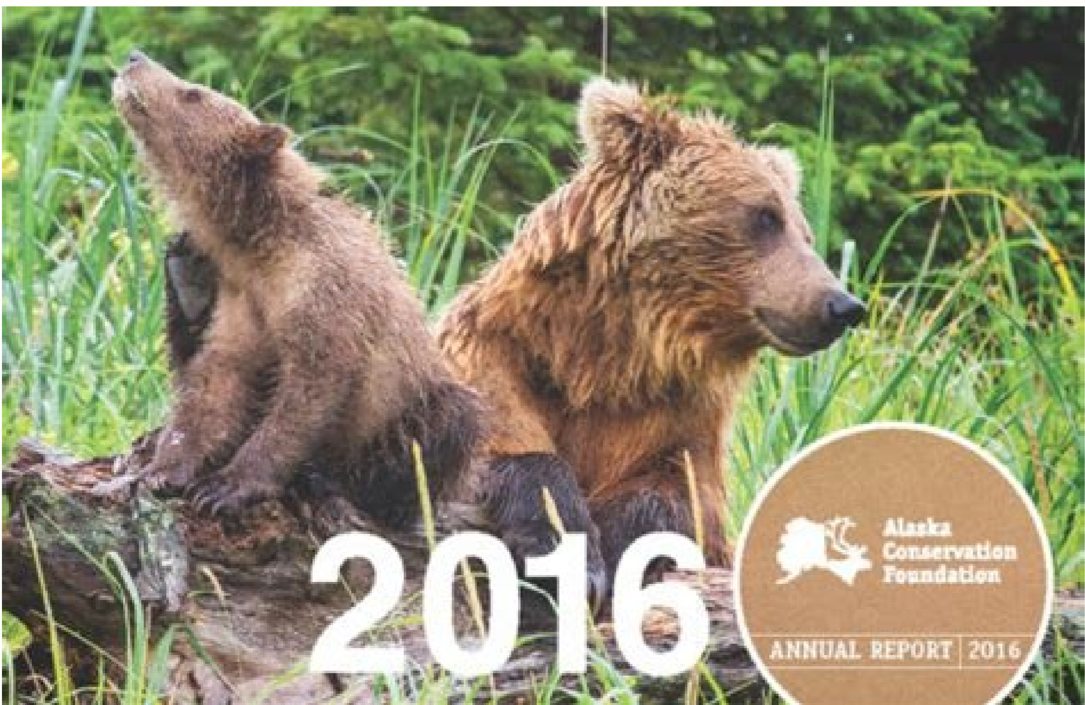
Alaska hunt results. Adfg alaska hunting regulations.